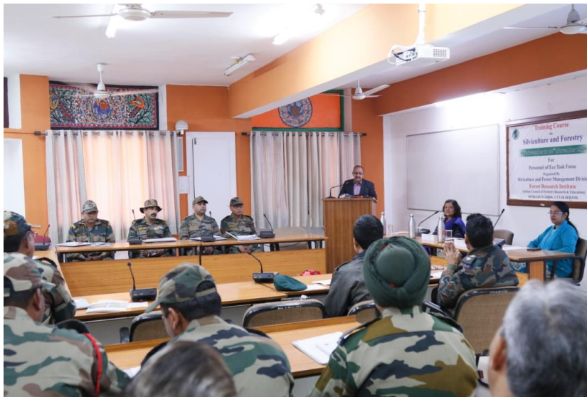
Inaugural Function of the Training Course